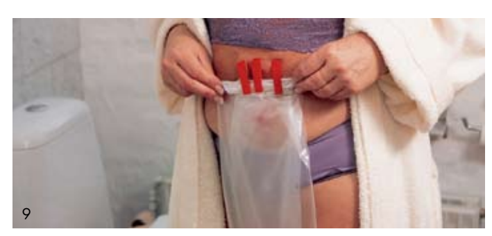
To allow you to move freely, roll up the sleeve and attach at the top using the pegs provided. Normally your colon will empty in 20 to 30 minutes.