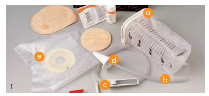
Begin by connecting the water container to the tubing, flow control/regulation clamp and cone.