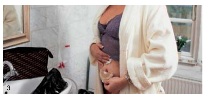
Remove your stoma pouch and clean the skin.