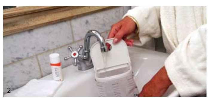
Fill the water container with lukewarm water (37°). Your Stoma Care Nurse will guide you in relation to the amount of water required to irrigate your colon.